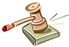
Governing Board Policy 5132(a)

The Governing Board believes that appropriate dress and grooming contribute to a productive learning environment. The Board expects students to