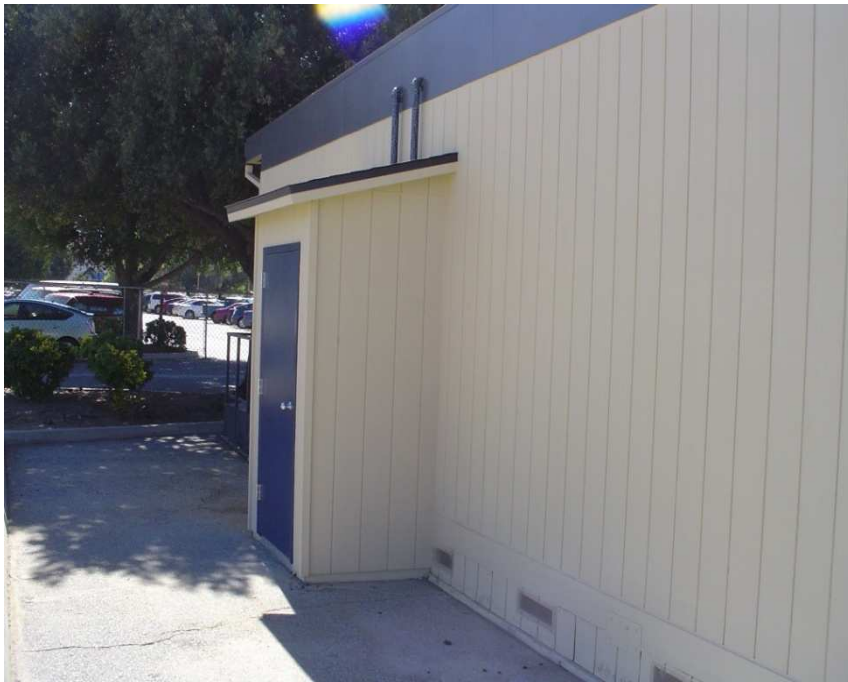
New water heater closet enclosure