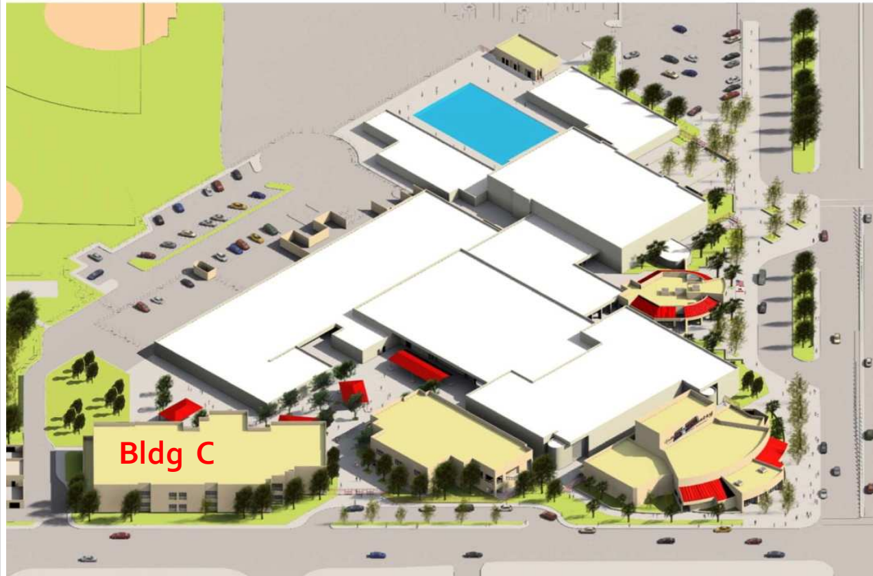
Hemet High School Modernization