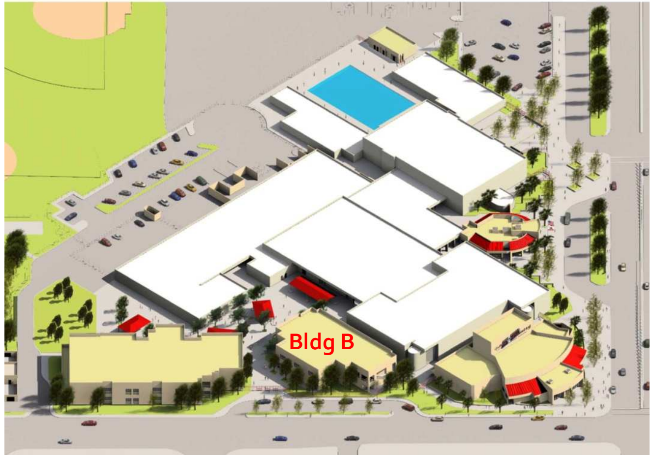
Hemet High School Modernization